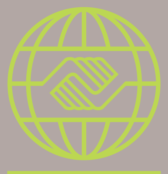
OUR EARTH. OUR HOME. OUR CLUB.