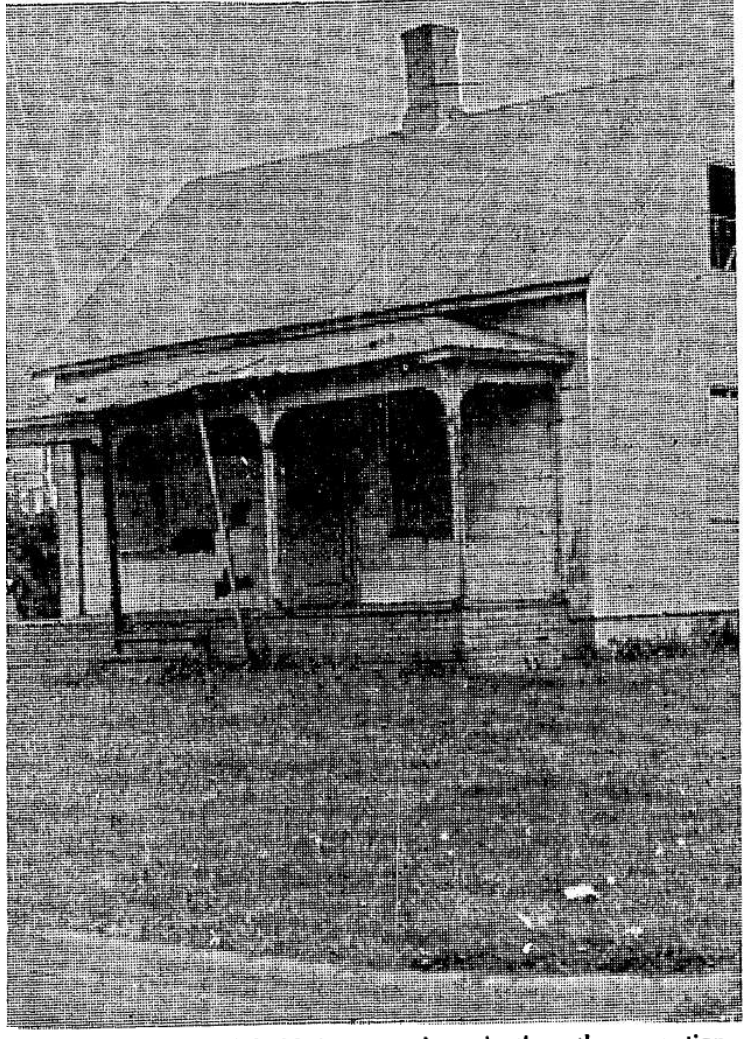
SUBSTANDARD HOUSING is more the rule than the exception in some of Champaign's predominantly black North End. Urban renewal was designed to change all that, but project delays and high costs for new housing will mean that many of the poor will go on living in homes like this.