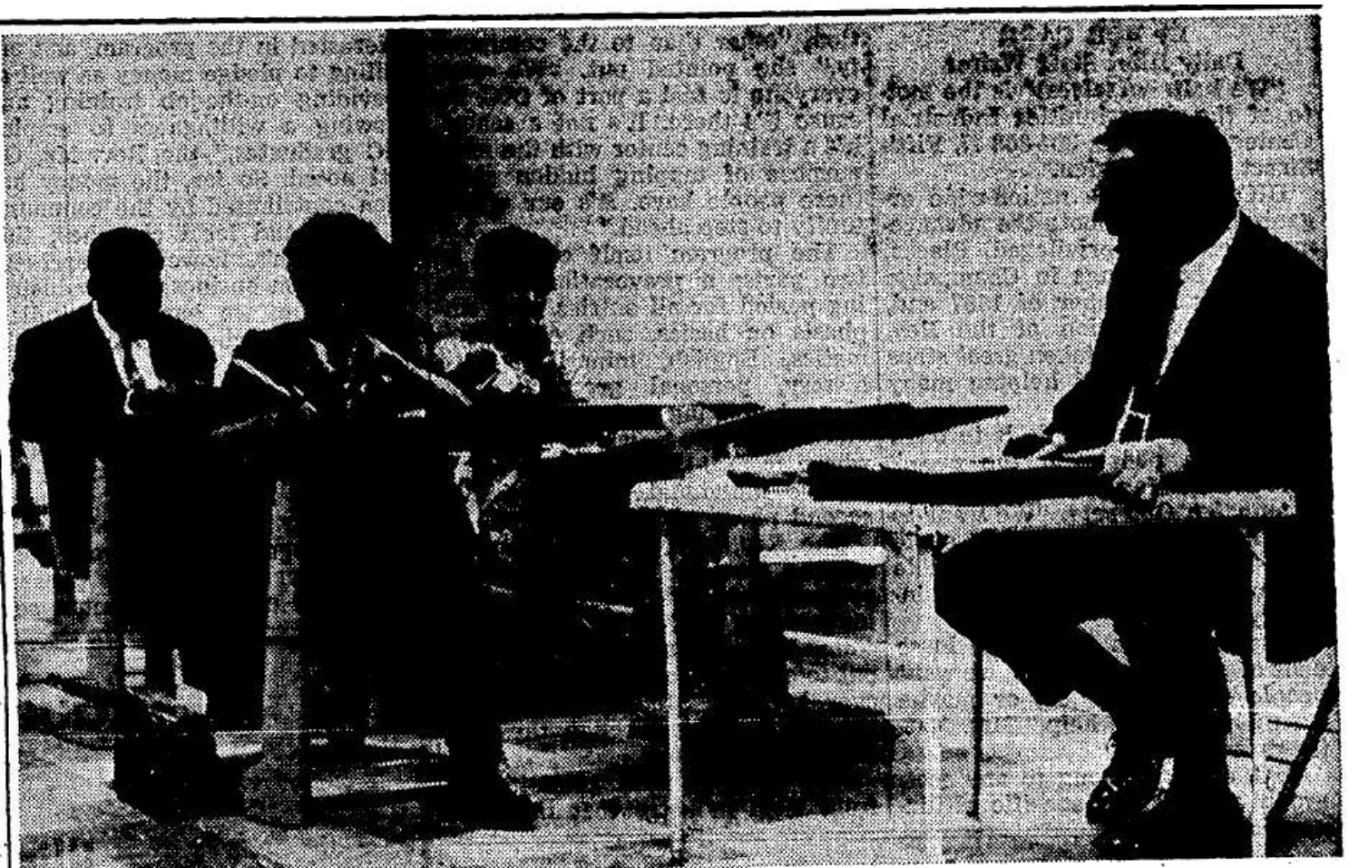
OPPORTUNITIES INDUSTRIALIZATION CENTER conducts classes in salesmanship on Friday evenings. Salesmanship is one of many classes offered by OIC.