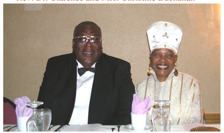
Centennial Banquet May 23, 2009