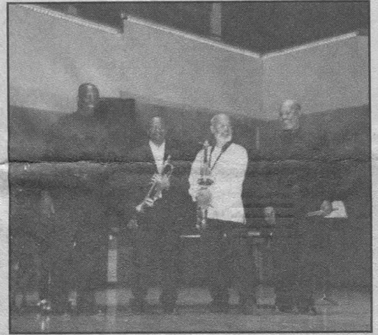
Chambana will perform at the annual NCNW gala November 22.

NCNW seeks to fill the gaps that exist in our communities; particularly in meeting the needs of minority women. The organization sponsors educational, economic, social, cultural and scientific projects nationally and in specific communities across the nation. Through its projects, the NCNW strives to achieve equality of opportunity and eliminate prejudice and dis-